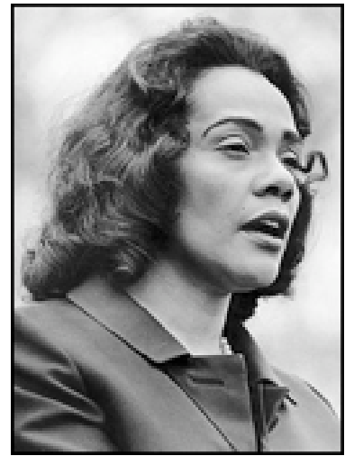
CORETTA SCOTT KING 1928 - 2006

The US and the world lost a great activist on January 31. Coretta Scott King lived a life dedicated to many social justice issues including civil rights, peace, women's rights, lesbian and gay rights, anti-apartheid activism, and AIDS/HIV prevention. Among her many achievements, she founded the King Center in Atlanta in 1968 and was instrumental in establishing a national holiday in honor of Dr. Martin Luther King, Jr.